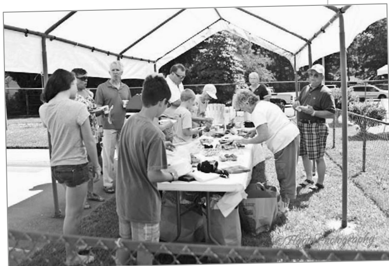
Residents enjoy food and drinks at the pool after the commemoration ceremony