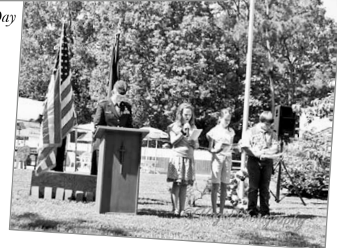
The Reading of Names of our Fallen Heroes, Veterans and Nation's Warriors by local Girl Scout and Boy Scout Troops